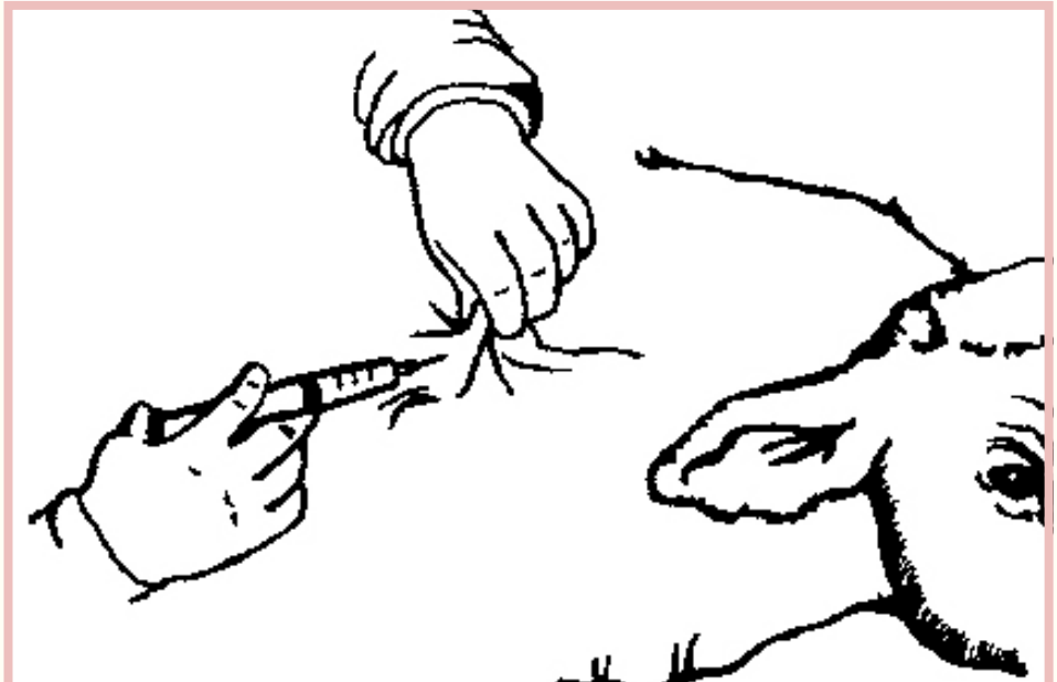
From FAO, "A manual for primary animal health care worker," http://www.fao.org/docrep/T0690E/t0690e0d.htm

The bag and attached tubing can be stored in the fridge for several months in a resealable plastic bag if you don't use it all at once.